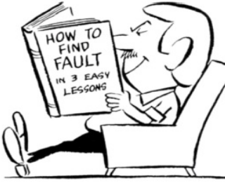
Fault is the easiest thing in the world to find.